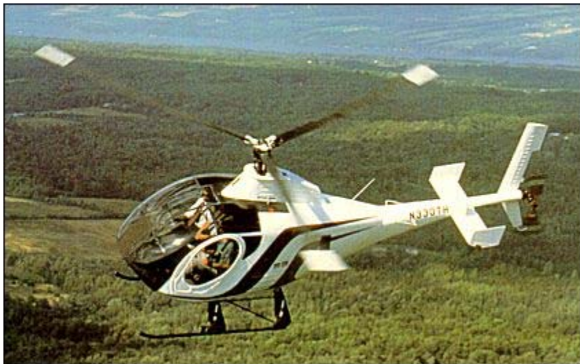
Figure 2. Schweizer 330 helicopter 4

Schweizer Aircraft, well known for the production of non-powered FAA certified gliders, has designed and built aircraft for over fifty years. In 1986, the Schweizer company acquired from McDonnell Douglas the production and manufacturing rights to the Hughes 300 helicopter, which it had been building under license since 1983. In 1987, Schweizer announced it was developing an improved turbine powered version of the Hughes 300 model, the Schweizer 330. The 330 was designed to fulfill a variety of roles including utility, law enforcement, observation, patrol, photography, transport, agricultural and training. The first deliveries of the Schweizer 330 took place in mid 1993. 3